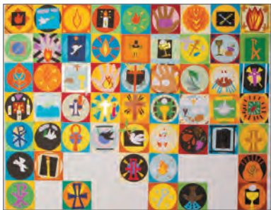
Our Catholic Identity Year 6 St Bernadette's School, Sunshine North

This document has been developed as part of the Horizons of Hope, Education Framework publication series. Catholic Education Melbourne wishes to acknowledge the following schools and students who have contributed artwork to support the development of this Horizons of Hope Foundation Statement: Religious Dimension of the Catholic School publication.