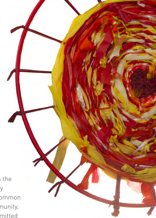
Sun and Moon – The Creation Story The students worked collaboratively to create weavings that represent the sun and the moon of the Creation story. (Years 1 and 2)

The religious dimension of Catholic education focuses the members of the community outward, working for the common good. As an ecclesial community, the Catholic school is committed to promoting the Kingdom of God, bringing it to life through its action for justice and peace both locally and globally. Its educational project is impelled by the message of Christ to be hope-filled and future-oriented, drawing students into a vision for a just and compassionate world.