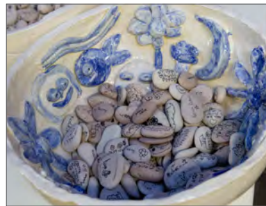
Blessing Bowls Whole school Foundation-Year 6 Sacred Heart School, Oakleigh